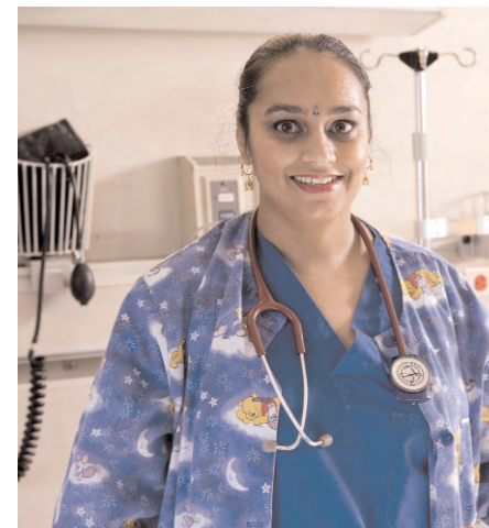
Primaldeep Stephens Respiratory Care

28 Hendersonville Road Asheville, NC 28803 828-277-1510 www.rezaz.com