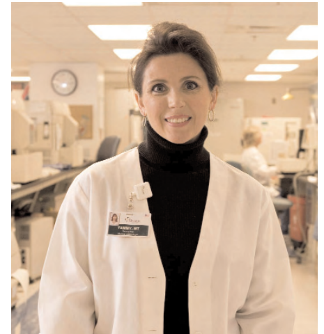
Tammy Fox Lab

53 Asheland Avenue, Suite 105 Asheville, NC 28801 828-251-5909 www.ymcawnc.org