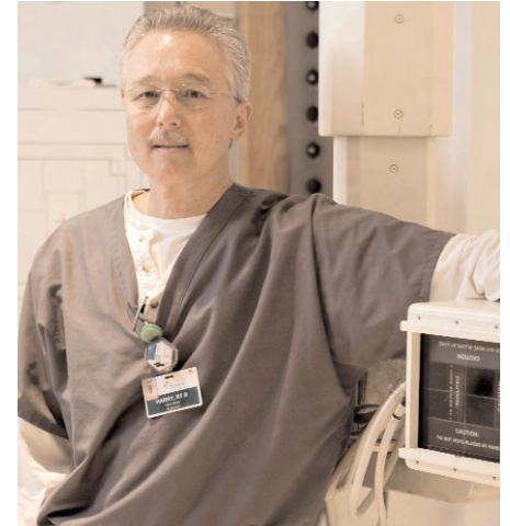
Harry Kemp Radiology Diagnostics

891M Patton Avenue Asheville, NC 28806 828-225-5931